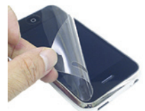
Protect screen with clear, protective film & polishing cloth