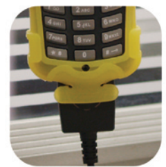
Integrated data cable port flip-lid