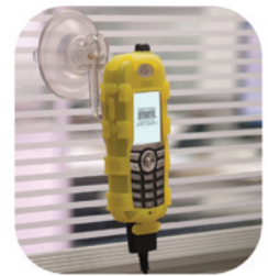
Compatible with zCover window clip