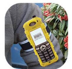
Compatible with zCover arm band