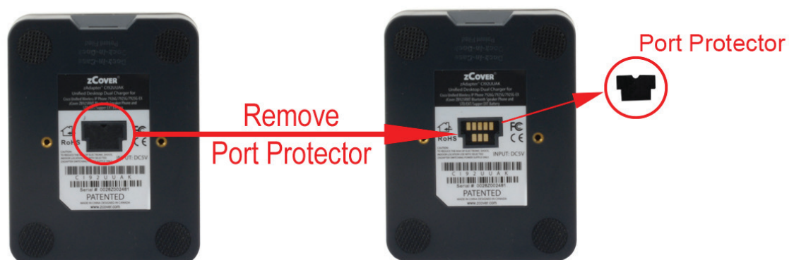
Figure 3. Remove Port Blocker from Desktop Charger

Each Desktop Charger has a black rubber Protector on the bottom. Remove it before you process the next step