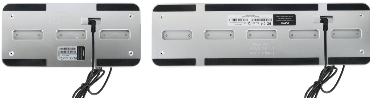
Figure 5. Connect AC Adapter

Connect zCover Global AC Adapter to the Unified Power Dock Rack.