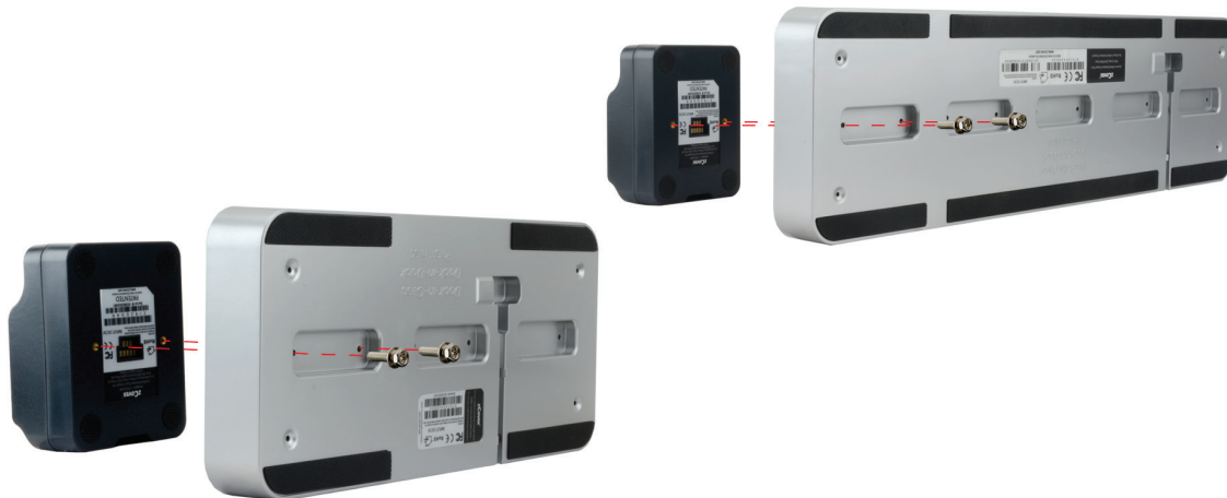
Figure 4. Fasten Desktop Chargers to the Unified Power Dock Rack

Make sure all Desktop Chargers sit in the slots perfectly before fasten the screws.