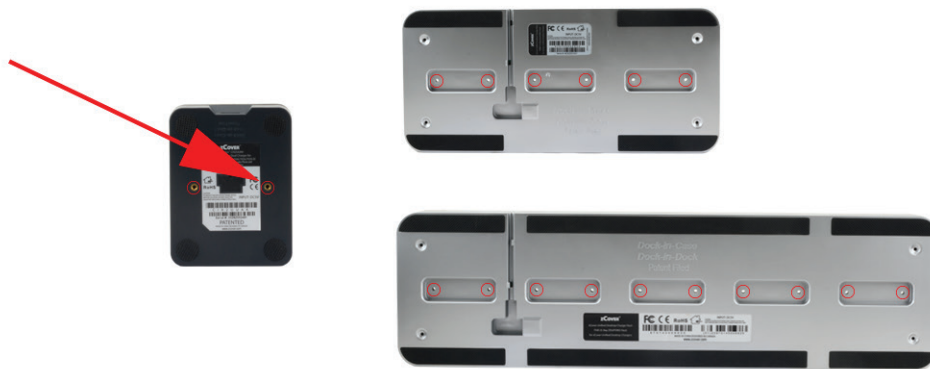
Figure 2. Threaded screw holes on the bottom

The ZDUPSRK3 / ZDUPSRK5 zAdapter® Unified Power Dock Rack is the accessory that you can mount multiple UDA/USB Unified Desktop Chargers on it and make a gang charger. Screw holes have been pre-threaded on the bottom of zCover Unified Desktop Chargers and Unified Power Dock Rack to accept machine screws ONLY (Screws are included in the kit).