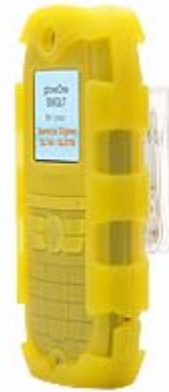
Tough Yellow SMGL7HYL