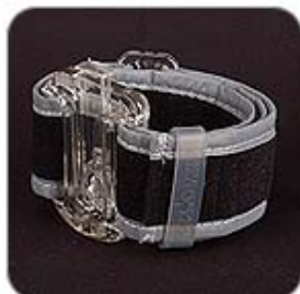
zCover Universal Armband