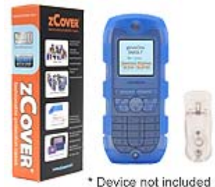
* Device not included