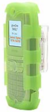
Tough Green SMGL7HGN