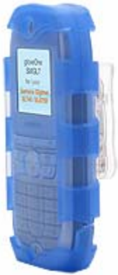
Tough Blue SMGL7HBL

zCover gloveOne SMGL7H is crafted for Siemens ® gigaset SL740/SLX750 zCover gloveOne Tough integrated Port Covers and Keypad Protector