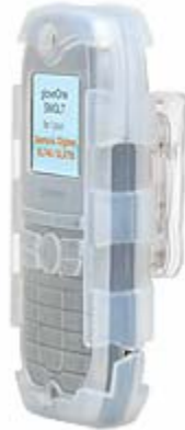
Tough Ice Clear SMGL7HIN