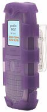
Tough Purple SMGL7HPL