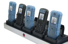
Unified 5 slots Multi-Charger