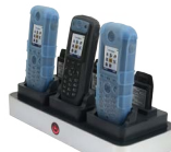
Unified 3 slots Multi-Charger