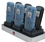
Unified 3 slots Multi-Charger