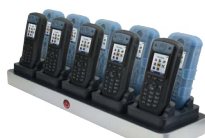
Unified 5 slots Multi-Charger