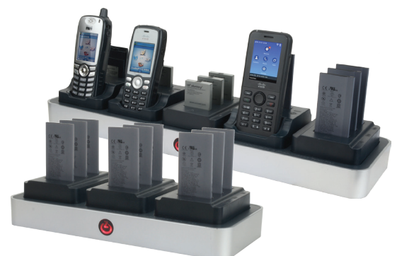
zCover Unified Modular Docking System